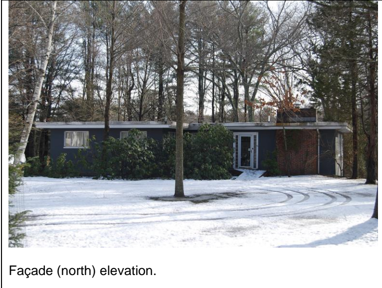
Façade (north) elevation.

Locus Map Map #s are last digits of lot #s, not street #s.