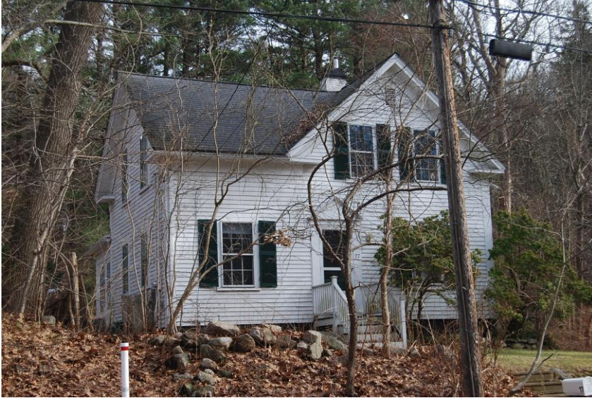
North and West (facade) elevations.