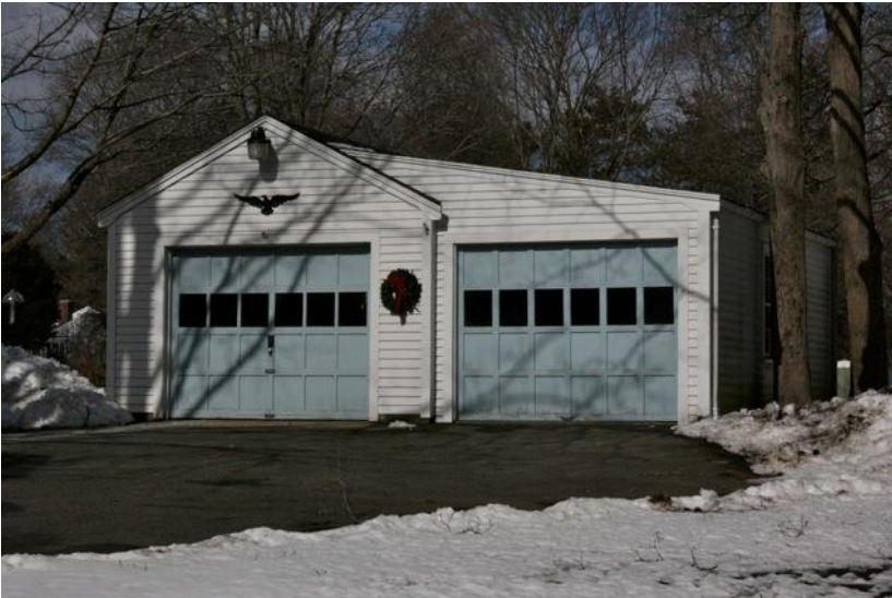
Garage. Façade (south) elevation.