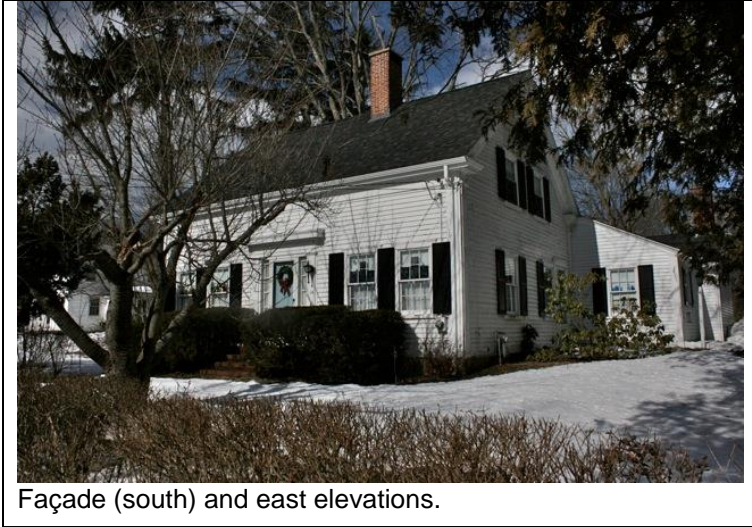
Façade (south) and east elevations.