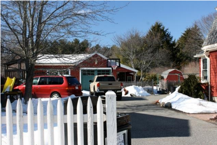
Garage. East (main) elevation.