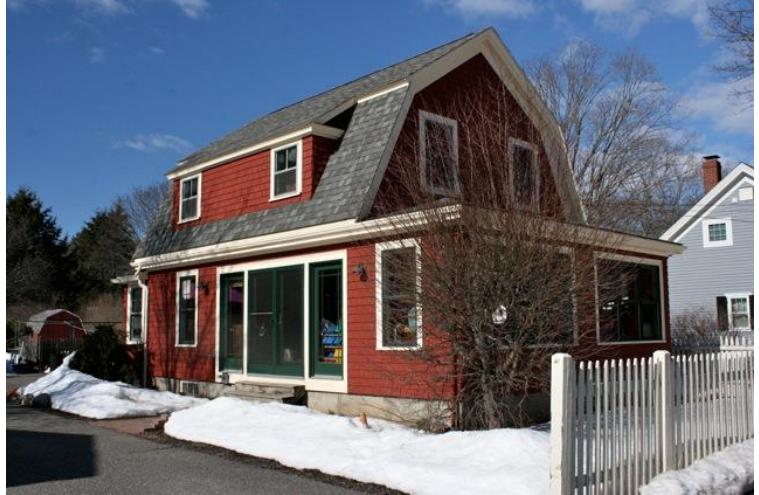
Façade (east) and south elevations.