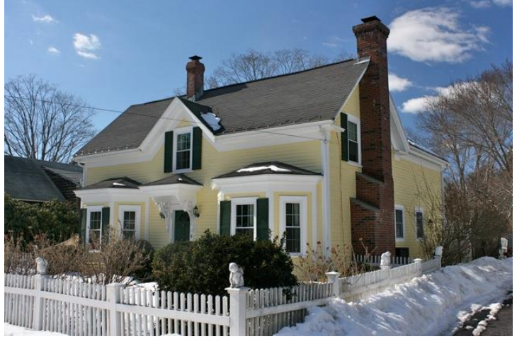
Façade (east) and north elevations.