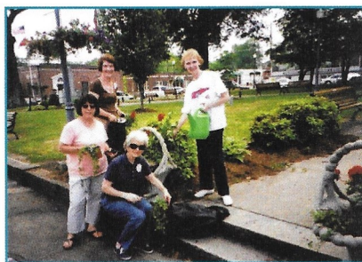
Quality of Life