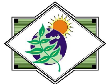
Natural Resources and Agriscience