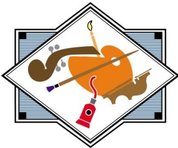
Arts & Communication

Career direction and course selection should be guided by the student's interests, aptitudes and educational goals. Although students may choose from any of the elective courses in our curriculum, we recommend that careful consideration be given to the elective courses that are listed under the student's Career Pathway of choice.