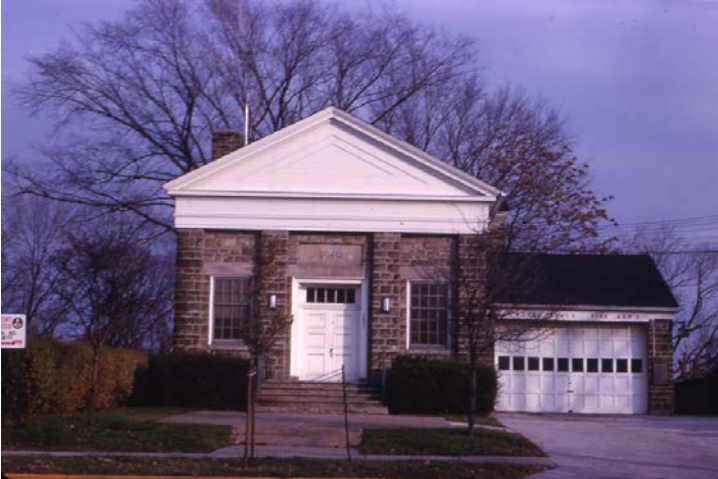
In 1962, when this photo was taken, this building served as Olmsted Falls Village Hall and also housed the fire and police departments. The building later was named the Bonsey Building for Charles Bonsey, who was mayor when it was built in the early 1940s. Now it is the home of the Moosehead restaurant and the Roberts Law Firm.