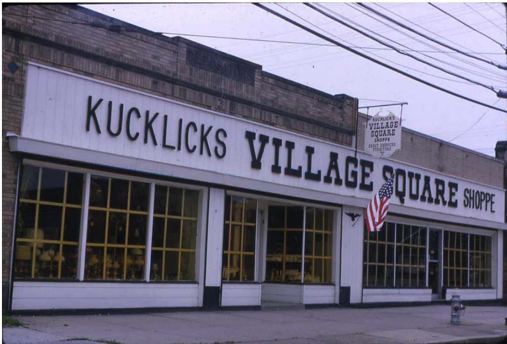
By 1964, when this photo was taken, Kucklick's had updated the building's façade and was specializing in early American-style furniture under the name Village Square Shoppe.