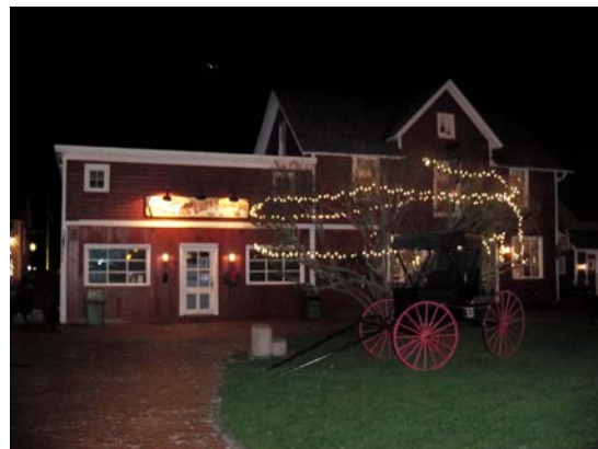
Grand Pacific Junction during a recent holiday season