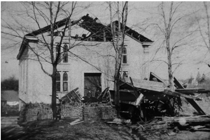
The 1910 storm knocked the steeple right off of the church. Bricks were stacked in front of the church because they were being used to pave Columbia Road at the time.

More than 20 years later, in 1910, the structure suffered an unplanned change when a big storm blew the steeple off of the front of the building. It opened a wide section of the roof. The congregation fixed the roof but did not rebuild the steeple, so that change remained permanent – at least for eight decades.