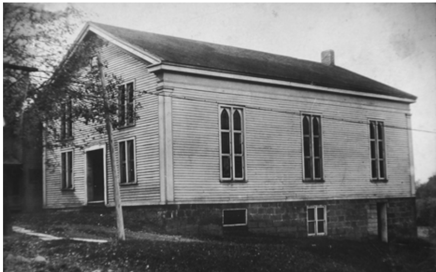
This is how the old building looked during much of the 20th century after it lost its steeple.

Although many people from Olmsted recall that the building now known as the Grand Pacific Wedding Chapel previously served as the Masonic Lodge, it began in the mid-1800s as a church. It also did double duty as a town hall for many years.