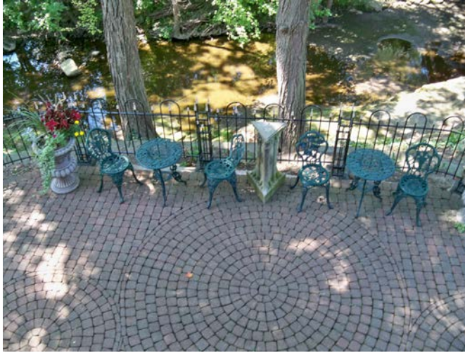
The back patio of the Grand Pacific Wedding Chapel overlooks Plum Creek