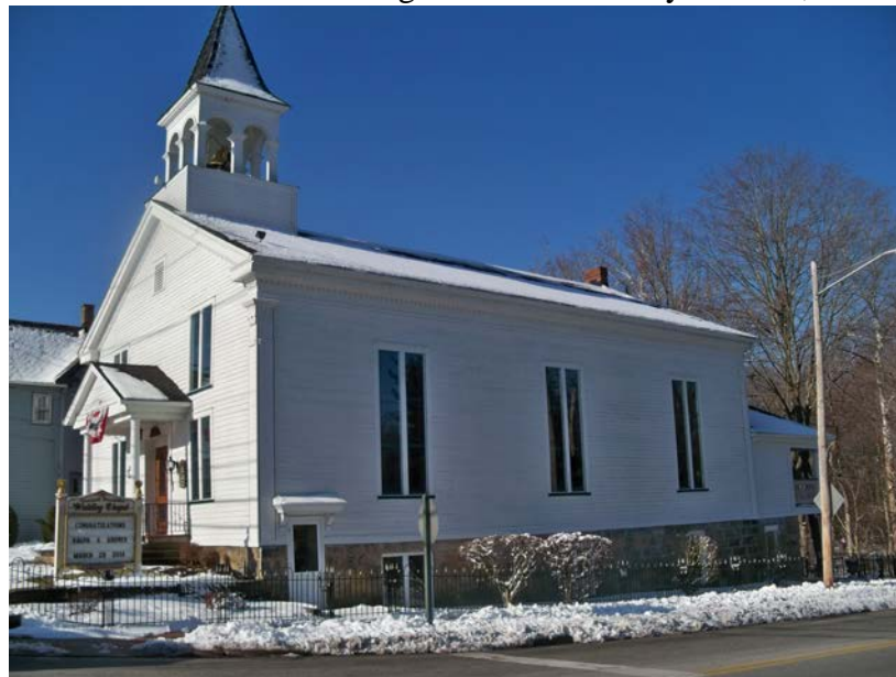
This is what the building looks like since it had its steeple restored and became the Grand Pacific Wedding Chapel.

In the coat room of the Wedding Chapel, Williams has