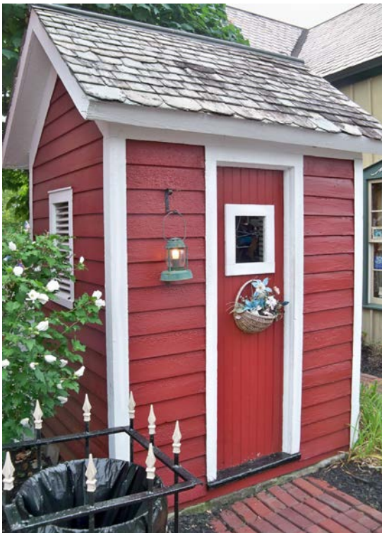
The outhouse between the Livery Stable and Carriage House plays music.