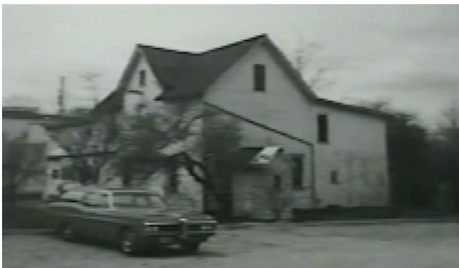
This was the Livery Stable before it was renovated. Notice how close the outhouse was to it then.