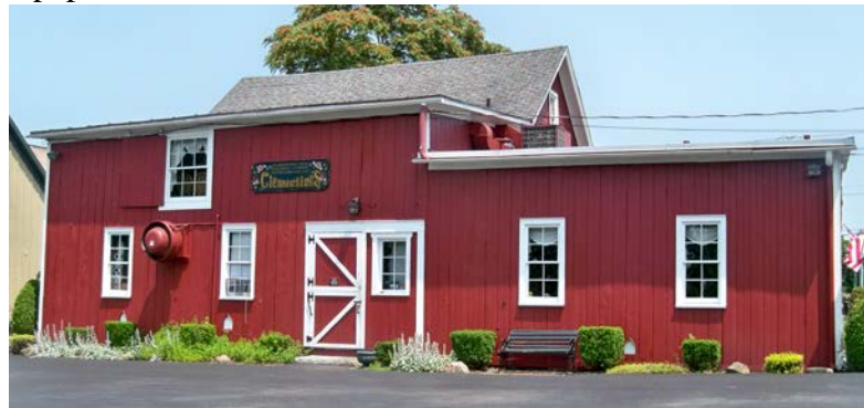
When the building was used as a stable, horses could stick their heads out the back. Chickens could go through the little hatches near the ground.

place; then you will have the finest property in the township." Perhaps the "old barn" was an older building on the site that later was replaced by the Livery Stable. Barns tended to get little attention in the newspaper, so it is not clear if that was the case because it wasn't mentioned again. But if so, then the earliest the Livery Stable would have been built was 1899, assuming that late October would have been too late in the year to start building a stable or barn in 1898.