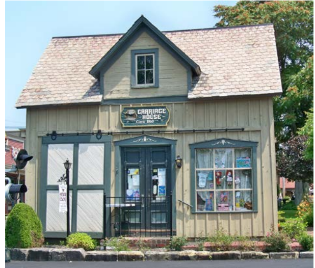
This pair of photos shows the Carriage House being renovated and then as it looks today.

"The Carriage House has three levels in it," he said. "There's no walls or nothing, so...I exposed the beams on the ceiling. We redid the steps, redid the staircase. All of that was redone. The doors came out of the antiques in a bank in downtown Cleveland."