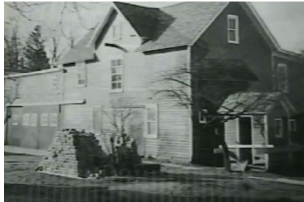
Here is the Livery Stable during the process of renovation and creation of Grand Pacific Junction. Note that the outhouse is farther from it.