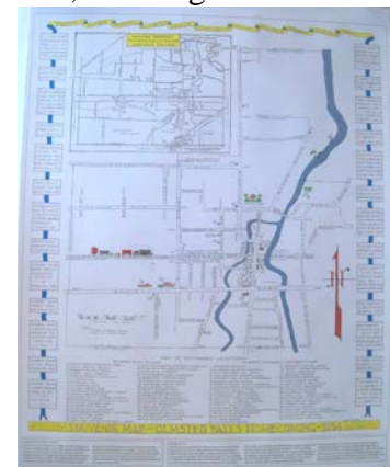
This is the new version of the 1954 Olmsted map.