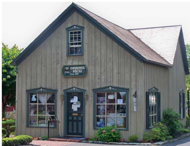
This is what the east side of the Carriage House looks like today.

But that wasn’t the first location for the Carriage House. Williams said it originally belonged with a house that stood along Columbia Road until the house was destroyed by a fire. That apparently was the January 1913 fire that also destroyed W.G. Locke’s store and Joe Anton’s tin shop. More than a decade after those buildings burned down, the Depositors Building was constructed on the site. Without the house it went with, the Carriage House at some time was moved away from the road and toward Plum Creek.