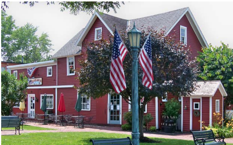
This is the Livery Stable today with Falls Ice Cream and Clementine’s in it.