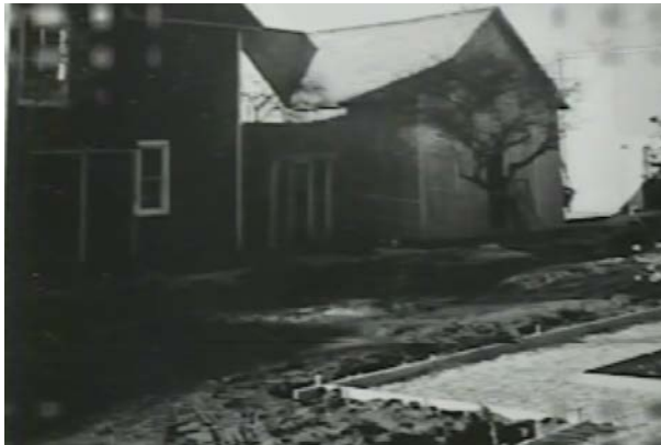
The Carriage House was moved close to the Livery Stable during the development of Grand Pacific Junction.