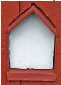
This hatch was for chickens.

"If you look in the ice cream shop or go on the back side of Clementine's party room