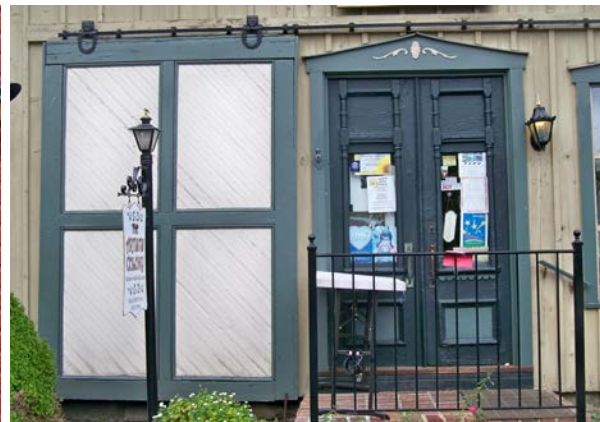
Just decorative now, sliding doors and rails remain on the Livery Stable and Carriage House.

Both the Carriage House and the Livery Stable also have other doors and overhead rails to slide them on. They aren't used anymore but show the types of doors that such buildings typically had more than a century ago.