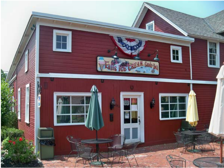
One end of the Livery Stable houses Falls Ice Cream.

hardware store in 1893. Williams's best estimated is that the Livery Stable was constructed shortly before 1900, perhaps as early as 1895.