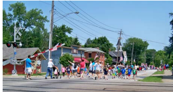
These two photos show the Independence Day parade heading north on Columbia Road near Grand Pacific Junction. The Heritage Days parade will go the opposite direction and end at Grand Pacific Junction.