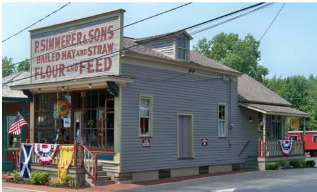
The Granary now houses Shamrock & Rose Creations, the Celtic gift shop.

One such building is the Granary, which now is home to Shamrock & Rose Creations, the Celtic gift shop at 25576 Mill Street. As the name suggests, it once was a