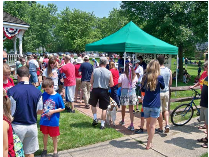
After the Independence Day parade, people gathered at the Village Green for an ice cream social.