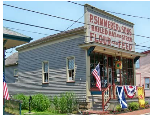
These photos taken a few weeks ago show the Granary as it looks today, a quarter century after its renovation.