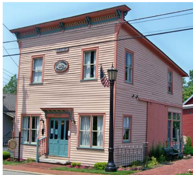
This is another recent photo of the Warehouse.