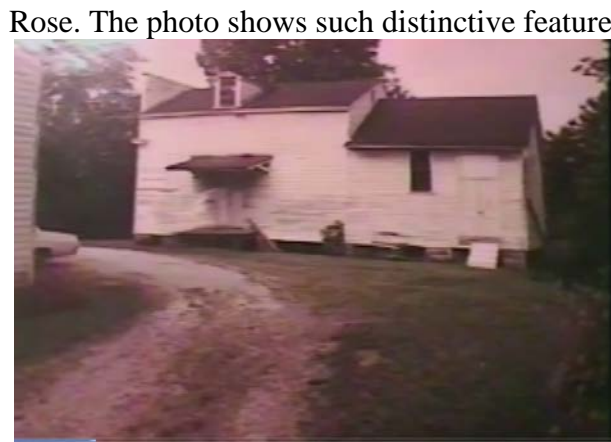
Another photo of the Granary from a Grand Pacific Junction video shows its deteriorated condition prior to renovation.