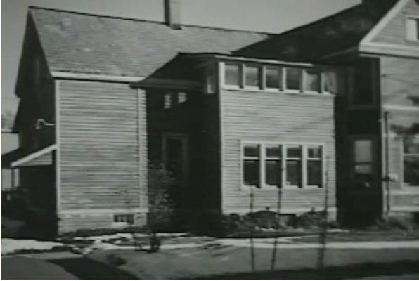
This is another view of the side and rear of the Simmerer house before a new porch was added.