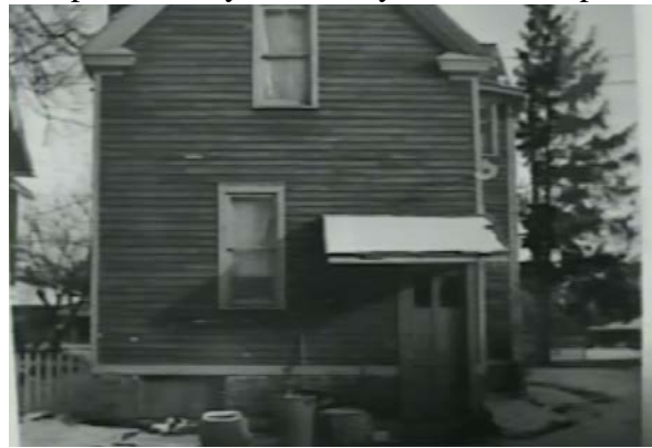
This is how the rear of the Simmerer house looked before the porch was added.