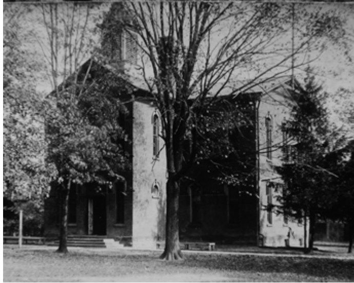
This photo of the Union School was taken in 1912, two years before it was determined to be unsafe and its use as a school ended.

The township and Olmsted Falls might have maintained separate school systems even longer if the village had not run into a big problem in 1914. Until then, all Olmsted Falls students had been taught in the Union School since it had been built on the Village Green in 1873. But in 1914, that building was declared to be structurally unsafe. Classes were moved to the old Town Hall (where the Moosehead restaurant now is located) while Olmsted Falls officials and citizens considered their options. The best option apparently was for Olmsted Falls to give up on going its separate way in schooling students and to join the township's district.