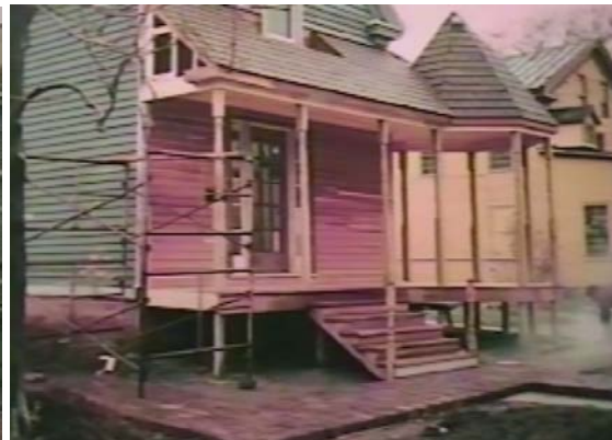
These photos show the Simmerer house during renovation as the new porch was being attached.