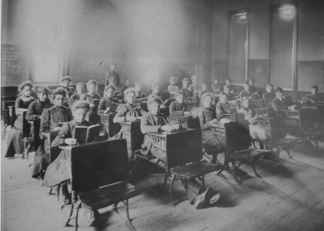
This was one of the Union School classrooms.

matter, but the April 23 edition of the Enterprise had this report on the village's vote: "The progressive element of the village are [sic] more than pleased by the result of election Tuesday. 50 to 32 in favor of better school conditions."