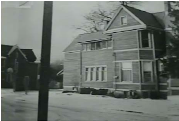
This is one view of the Simmerer house before it was renovated.