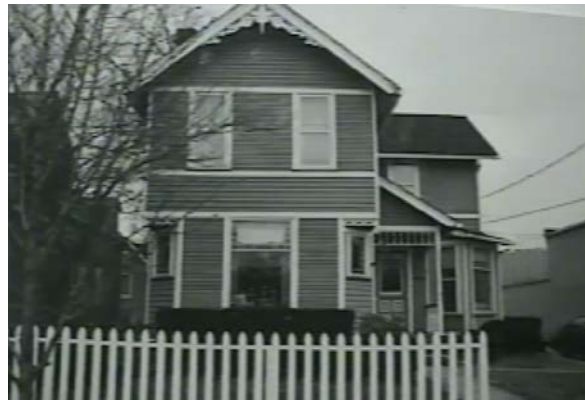
The Peltz house looked like this before its renovation as part of Grand Pacific Junction.