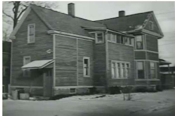
This is another view of the Simmerer house before renovation.