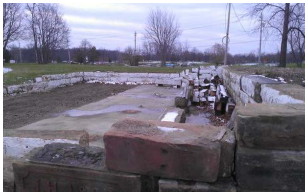
This was all that was left at the site on November 29.