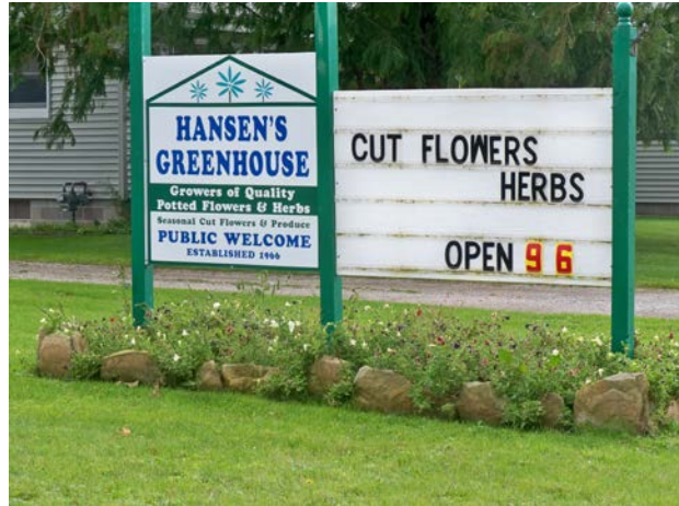
Hansen's Greenhouse is at 8781 Columbia Road.