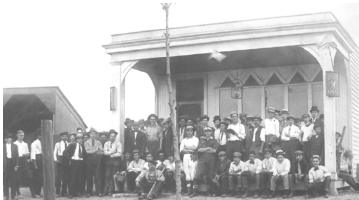
The White Elephant, between Olmsted Falls and West View, was one of the saloons more than a century ago.

In 1891, Olmsted Falls took another turn on the issue of saloons with a new municipal election. The Advertiser reported on April 24: “The new ‘wet’ Council have been sworn in and heard from. One of their first acts