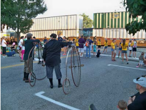
An Olmsted parade always includes waiting for trains.