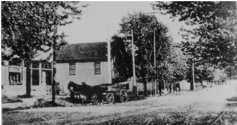
Olmsted Falls in the late 1800s still had unpaved streets that were travelled by horses and wagons.

The next mention of a saloon-related problem in Olmsted Falls appeared in the October 28, 1880, edition of the newspaper. It is a rambling item that is hard to decipher for someone who was not there at the time, but it refers to a “row in one of the village saloons” and generally laments what happened when alcohol got the best of otherwise intelligent people. The items ends with these words: “ Boys don’t drink! ”