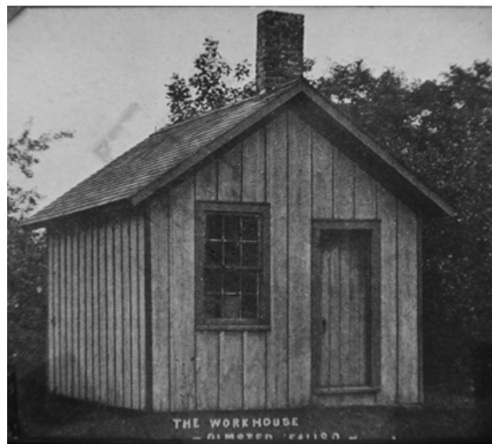
Some drinkers spent time in the old jail

That jail building still exists, although it is bigger than it was in the 1800s and in a different location. In the 1870s, the jail was a wooden building about 12 feet by 14 feet with iron bars and a thick door. It was located where the parking lot between the Olmsted Community Church and the Moosehead restaurant are now. But in November 1924, the village moved it to Mill Street to serve as a garage for a fire truck. Today, it is close to that location at 25546 Mill Street and houses Jorgensen's Apiary. When he incorporated the jail into Grand Pacific Junction, Clint Williams lengthened the building several feet so he could put in a restroom.