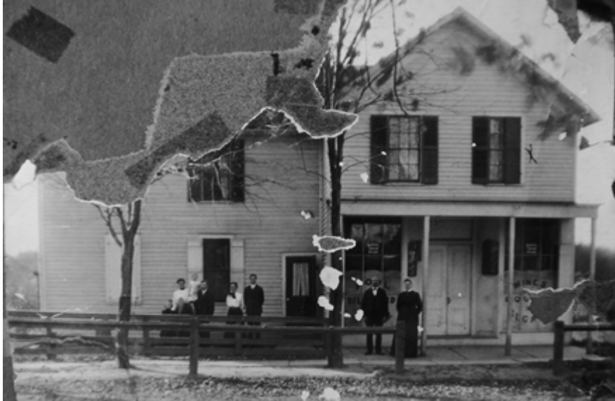
Fenderbosch's Saloon was expanded to include a pool hall. The former pool hall is now Master Cleaners at 7994 Columbia Road, and the former saloon contains the Olde Wine Cellar at 7990 Columbia Road.

Holzworth wrote that Fenderbosch's Saloon was popular and its patrons included the town's "most influential men." His book tells the story of the mayor who was arrested by the town marshal for carousing at Fenderbosch's saloon. As soon as the mayor got out of jail, he fired the marshal and appointed a new one, who threw the mayor into jail again for "his roisterous toasts and treats to townsmen over his victory."