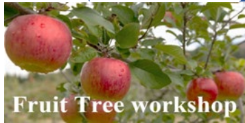
Fruit Tree workshop