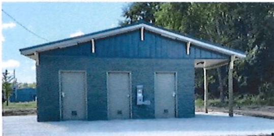
Krider World's Fair Garden Rest Area